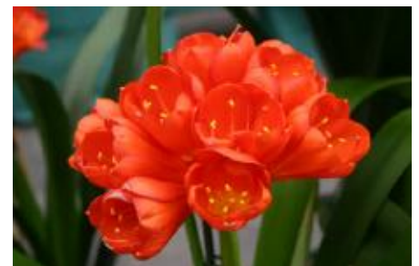
Jude Shapland - Red