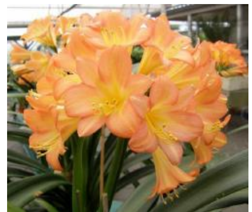
Diane x Yellow Tiger – Auckland Show