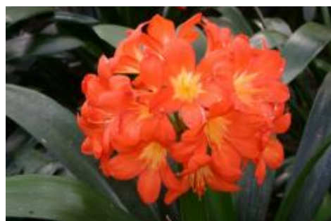
Large Orange Umbel