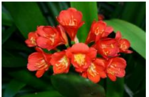
Similar form of the open red.