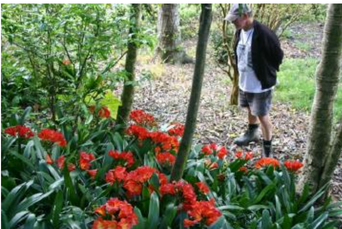
Brian Austen in front of a patch of reds.