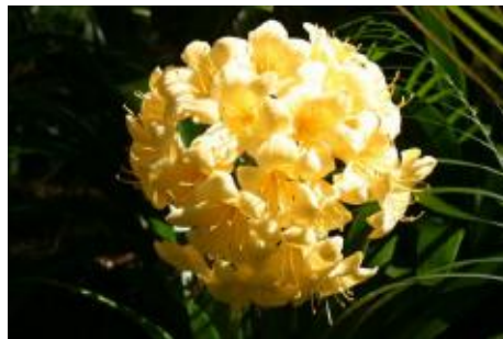
Large umbel recurved yellow