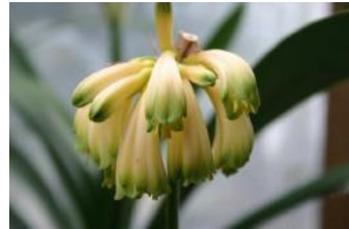
Ian Baldick – Yellow C. nobilis