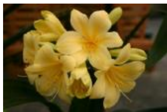
Dark Yellow – Jude Shapland