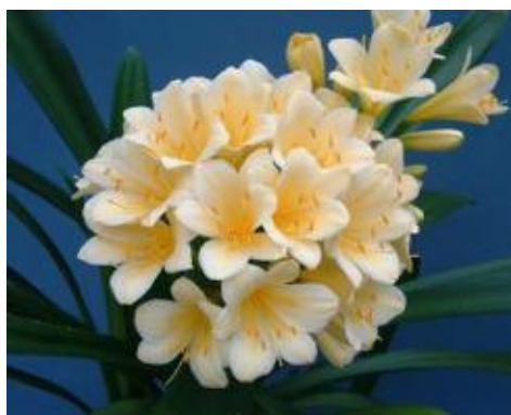
Oribi Gorge Yellow