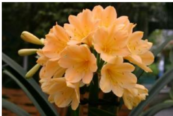
'People's Choice – Dave's Peach