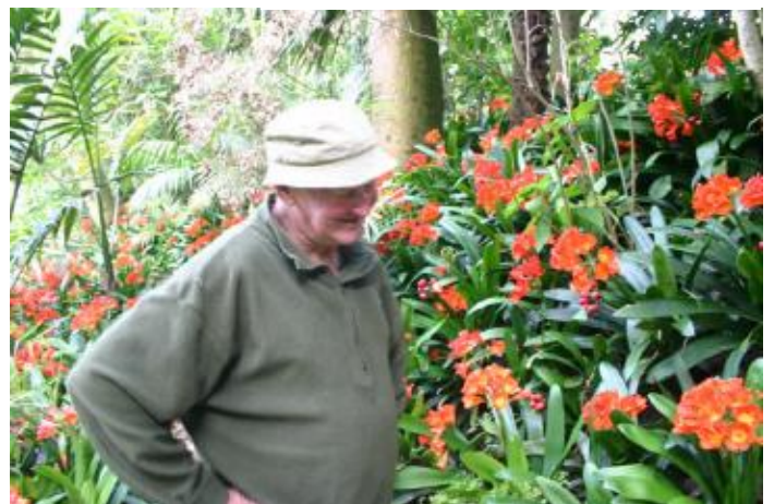
A lot of hard work, but a magnificent display.