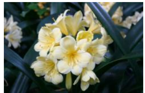
Friilly Edged Yellow