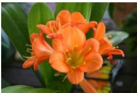
Diana Holt – Green Throat