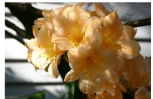
Stephanie Blamey- Chubbs Peach x Vico Yellow