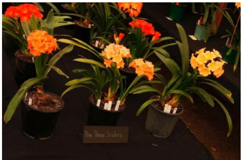
Three siblings – out of a separate cross from 'Diane', but also a miniata x cyrtanthiflora cross