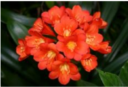
Open form Red