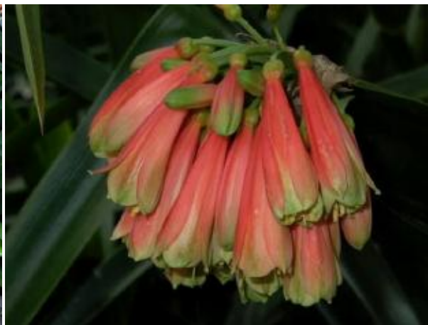
C. x cyrtanthiflora