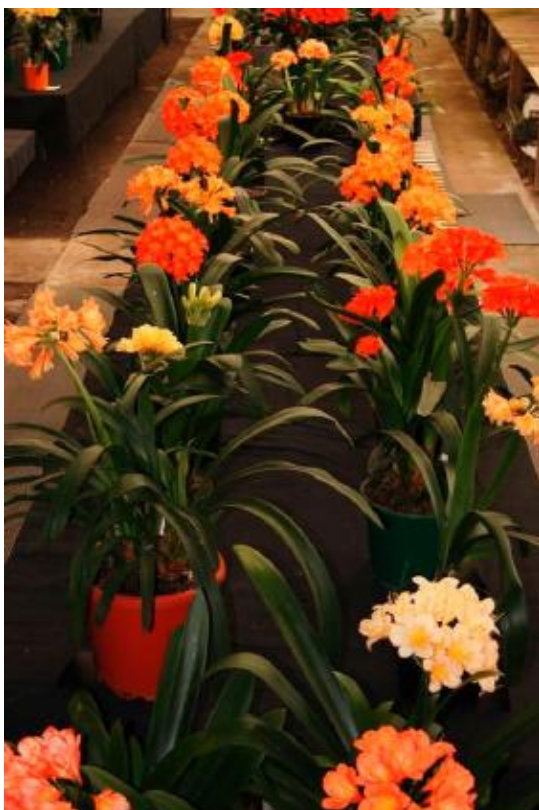
Dianne's progeny displayed at the Tauranga Show.