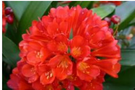
Many flowered umbel