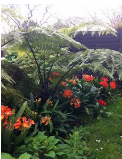
A great display in Helga Arlington's garden