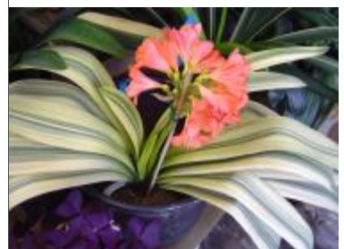
James Comstock plant