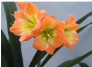
Green Throat Miniata