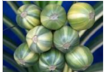
Variegated Berries (Web Photo)