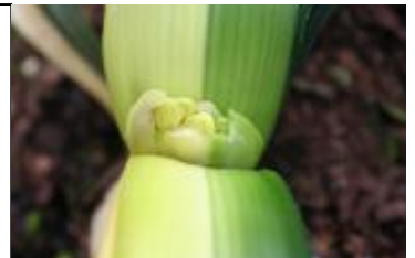
Variegated Scape (Web Photo)