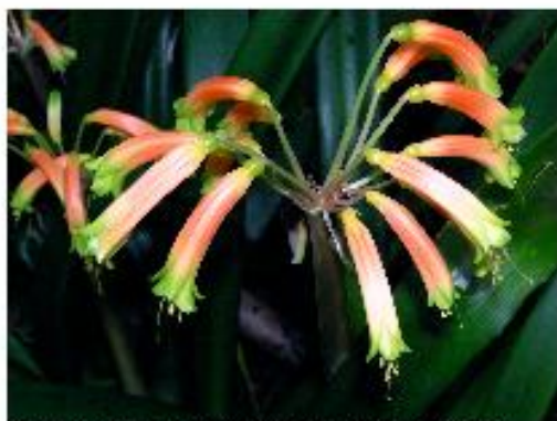
Fig 1. Clivia gardenii , Kawau Island, 31 May 2005

There are six species of Clivia , which typically grow in the cool shade of forest. The best known is the bush lily ( Clivia miniata (Lindl.) Regel) – very commonly cultivated in Auckland gardens, with large, upright orange flowers in spring (August-October). Eastern Cape clivia ( Clivia nobilis Lindl.) is the type species, and found in the eastern Cape Province under evergreen forest on coastal sand sites. The inflorescence consists of an umbel of 20-60 flowers borne on a peduncle about 300 mm long. The tubular, pendulous flowers are dark orange with green tips, but vary from pinkish yellow to dark red. Clivia mirabilis Rourke, only described in 2002, is unusual in that it is found on dry sites. Clivia caulescens R. A. Dyer is one of the rarer species. The other two species are swamp clivia or Pondoland clivia ( Clivia robusta B.G. Murray, Ran, de Lange, Hammett, Truter & Swanevelder) described in 2004, and it's smaller cousin, Major Garden's clivia ( Clivia gardenii Hook.), which is the subject of this article.