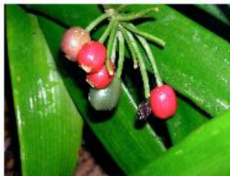
Fig 3. Clivia gardenii fruit, Auckland Botanic Gardens, 4 June 2005

On 31 May 2005 I found Clivia gardenii at Mansion House Bay, Kawau Island. It was growing in colonies under pines, not far from the Mansion House, but far enough to suggest the plants were wild (AK294269).