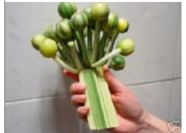
Variegated Stem ( Wu Jin ) Showing albino berries growing from pale part of stem.