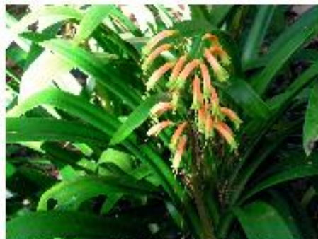
Fig 2. Clivia gardenii , Kawau Island, 31 May 2005

Clivia gardenii is cultivated in Auckland by Clivia enthusiasts, and it is represented in the Auckland Botanic Gardens. Keith Hammett has made a hybrid, "Winter Glory" by crossing C. miniata x C. gardenii , flowering June-July. The flowers of Clivia gardenii appear in late autumn/early winter and are pendulous, orange in colour, the petals tipped with green, and stigma and stamens strongly exerted. The bright red fleshy berries follow the flowers and are eaten by birds.