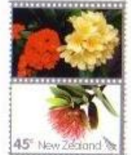
Photos from one of our members, Rita Watson. Rita's daughter arranged a set of personalised stamps from NZ Post, from this photo.