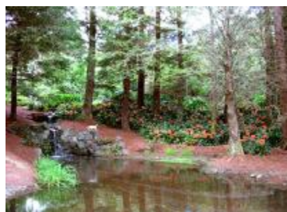
Clivias at Bev McConnell's garden 'Arylie's' in 2003, photos from Rita Watson.